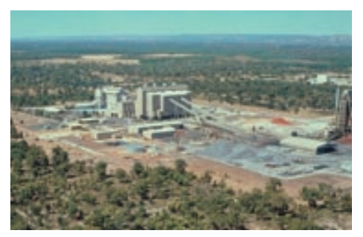
Simcoa Operations in Australia

silicon metal plant. By the end of 2011, this project will boost annual output capacity by 50% to 48,000 tons.